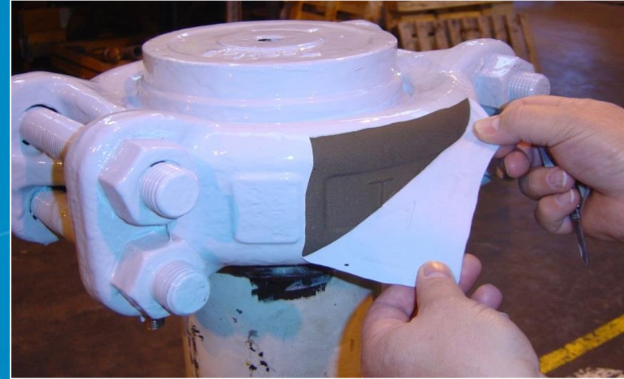
Cut & Peel (removal for inspection)