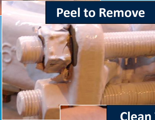
Peel to Remove