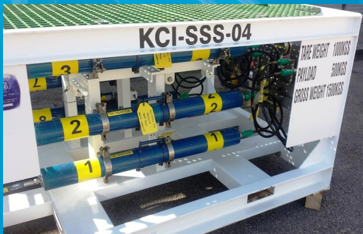
Skid Cylinders with Stainless Steel Brackets

Each Deployment Skid has 8 x 5 litre hydraulic cylinders giving a 40 Litre output capacity