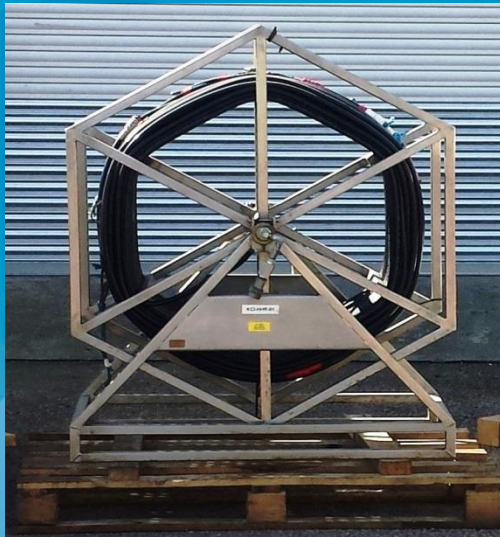
250m Umbilical Hose Reel