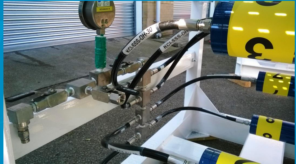
Skid Manifold & Pipework. (Corrosion protection in green)