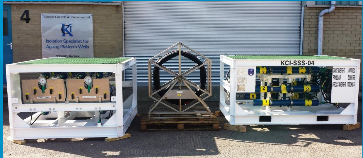
Side & End View of Skids with 250m Umbilical Hose Reel

Easy to fill and reload for a Fast Turnaround